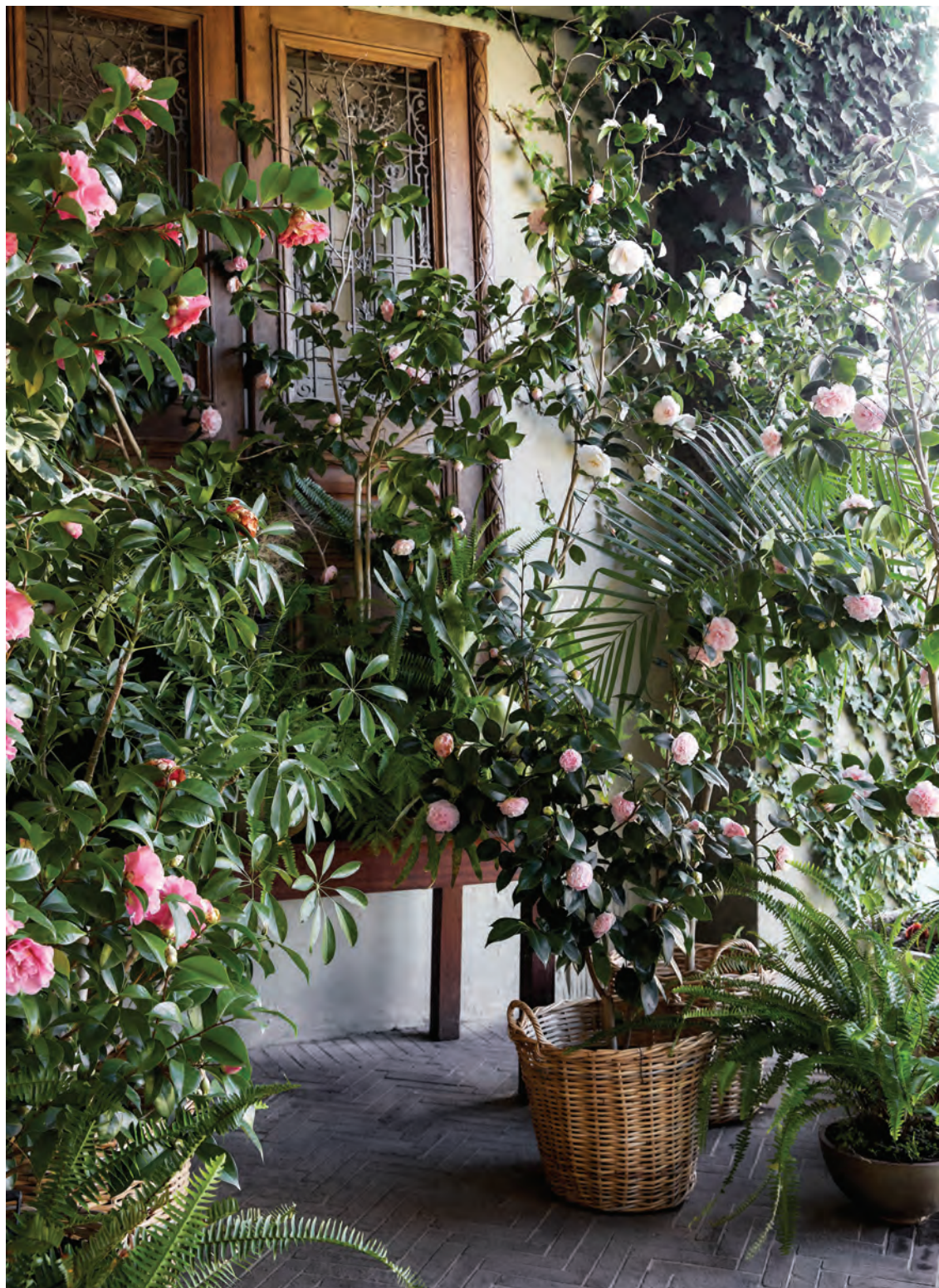
Above, a spectacular arrangement of winter-flowering camellias in baskets intermixed with potted ferns, created by Dané, are at one end of the intimate Die Stoep (The Veranda) venue at Johannesburg 1207.